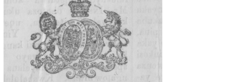
ZISHICILELWA NGE GUNYA.