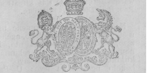
7IKHAP'II E IWA ' 'NICE ' 'YI INVA