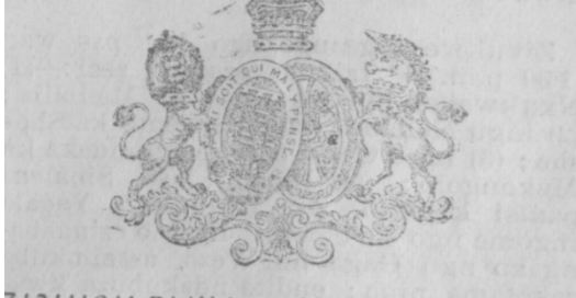
ZISHicilelwa nge GUNYA.