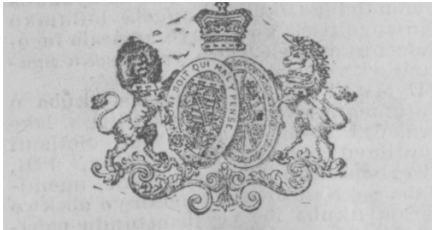
ZISHicilelwa NGE GUYA. Ifandesi Lemihla IZAZISO 8 AKOMKULU. —No 17, 1895. Kwi Ofisi yo Nocanda e Kapa. 12 March, 1895.

NGOKWE Siqundu II so Mteto No. 15 we 1887, kuyaziswa apa kumntu wonke ukuba ezi ziziba zomhlaba wa-Komkulu, okumandla wase Griqualand East, ziyi kutengiswa ngo fandesi pambi kwo ofisi ka Mantyi e MATATIELE ngexesha lesihumi kusasa, ngolwesi BINI, 28 MAY, ngokwezimiselo zalo Mteto ugentla, nange zimiselo zeli fandesi ezibhululeyo, nezingati zixelwe ngalomhla we fandesi.