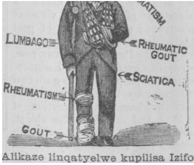
Alikaze linqatyelwe kupilisa Izifo

Alikaza linqatyelwe ukupilisa izifo Zamatambo. Isinqe, ingqaambo Zentloko.