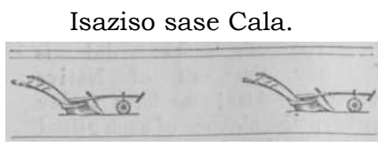
Isaziso sase Cala.