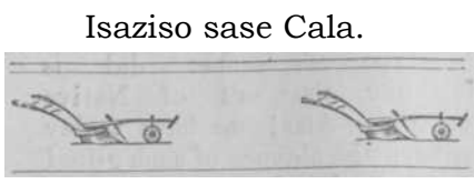
Isaziso sase Cala.