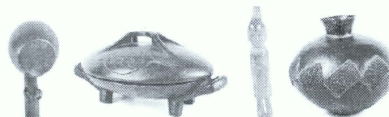
From L to R: JAG2012-6-98 Staff, North Nguni, Late 19 th century JAG2012-6-38a-b Meat dish, North Nguni/ Tsonga, 19 th / 20 th century JAG2012-6-76 Figure, North Nguni, 19 th century JAG2012-6-147 Pot, North Nguni, Late 19 th century