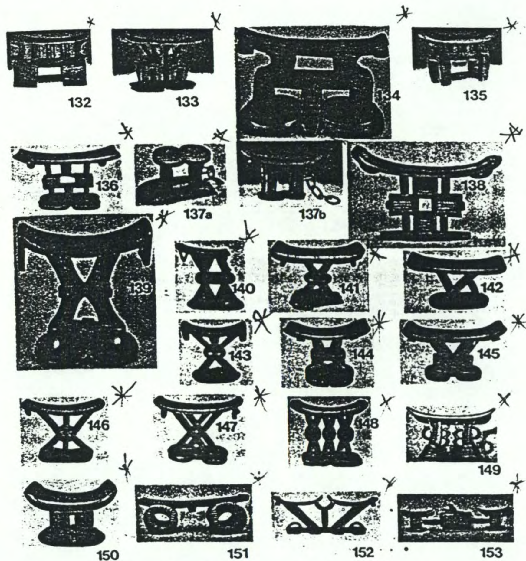
Plate 2 Shangaan head-rests.

Base: Two legs each, at front and back joined at top and bottom by horizontal bars.