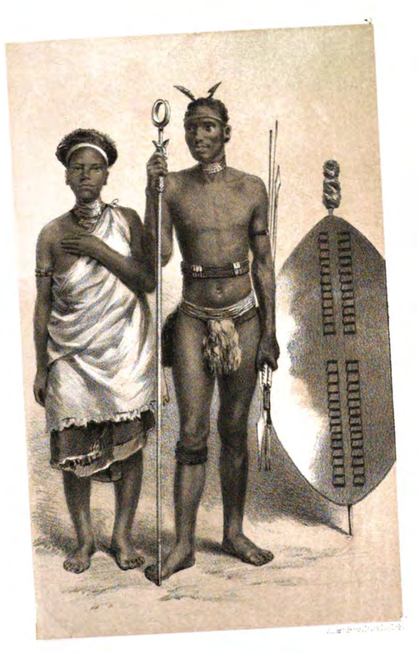
campa course of their and total