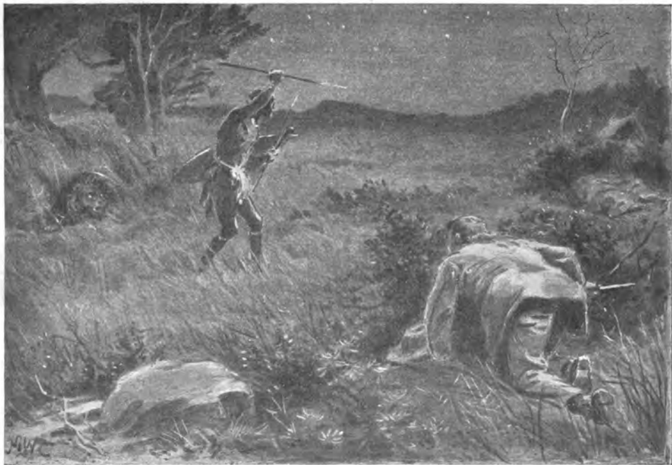
HANS GATHERED HIMSELF TOGETHER FOR A SPRING.— Page 98.