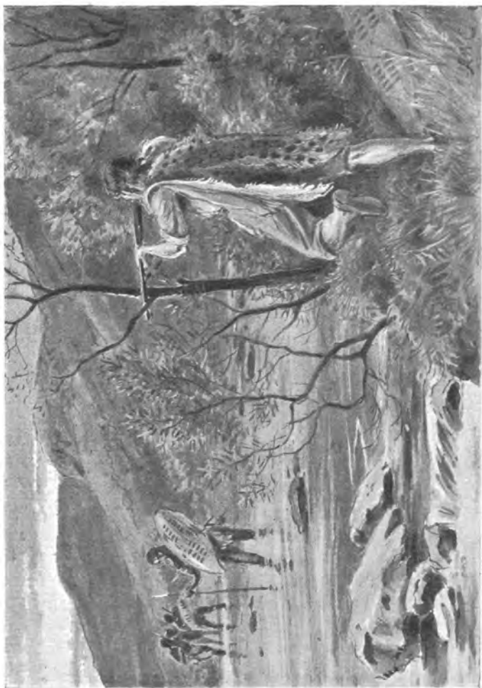
FOUR KAFFIRS ENTERED THE STREAM.—Page 192.