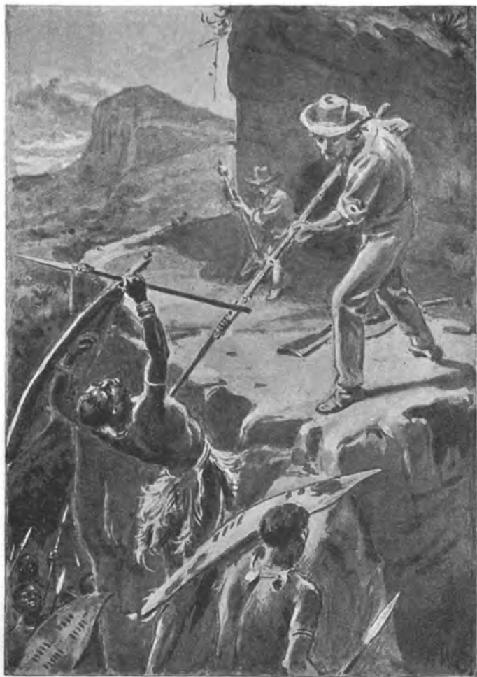
THE DEFENCE OF THE ROCK.